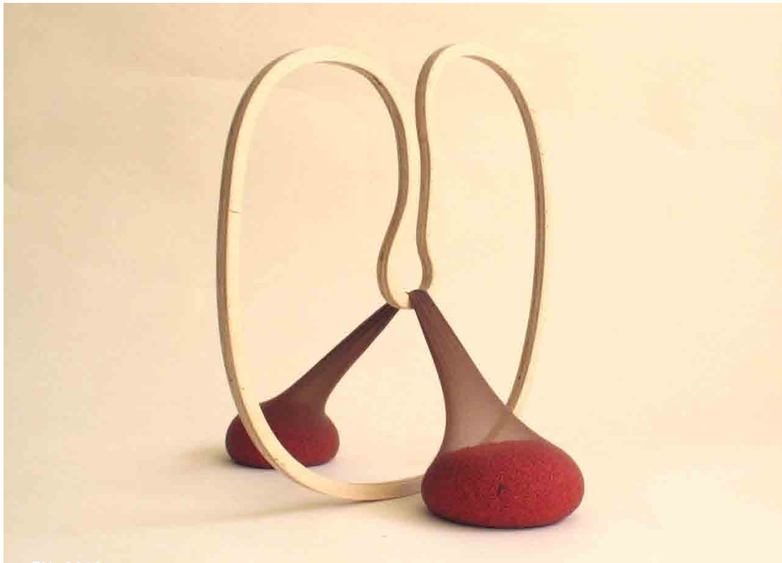
Once in Love, 2010 20 pieces and 5 APs 33.3 x 33.3 x 33.cm

Neto expands the practice of sculpture by using elastic fabrics, spices and polystyrene as his main materials, along with the force of gravity as a determining element. Physical interaction is another key aspect of his work. The viewer is invited to actively interact by touching, smelling or getting in the sculpture. The organic forms are brought up by observing the body as a representation of the inner part of the body, or an analogy between the body and the architecture.