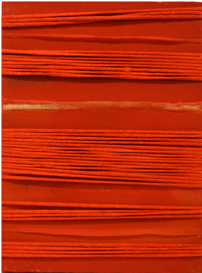
Seeds - Tramando, 2013 Urucum (pigment), oil, string 40 x 29 cm